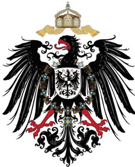
Fig. 2. Coat of Arms of the German Empire, 1871-1918