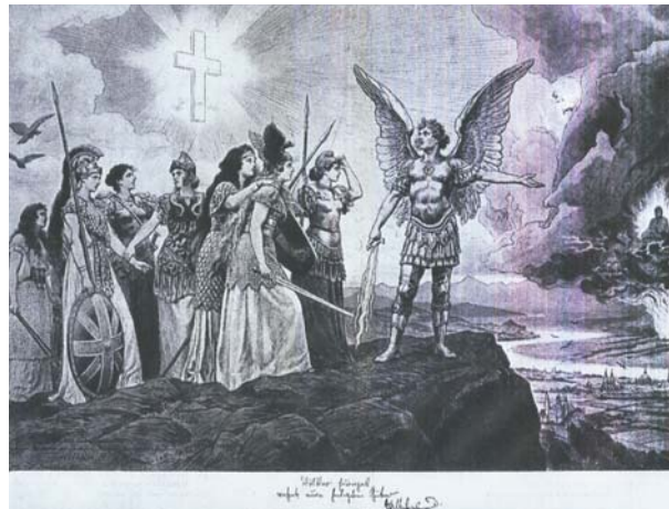
Fig. 3. “Yellow Danger,” by Hermann Knackfuß, 1895

New symbols, introduced after 1871, were more direct iconographic representations of the German nation. One of them was the Archangel Michael – the patron of the medieval Holy Roman Empire of the German Nation. In 1895, Kaiser Wilhelm II himself drafted an image of the Archangel that was then painted by Hermann Knackfuß (1848–1915) and published – in the time of German colonial expansion in China – under the intriguing title “Yellow Danger” ( Gelbe Gefahr ). The picture shows Archangel Michael with a fiery sword as the leader of other European nations invariably represented by female figures, such as Marianne, Britannia, Germania and Italia. The archangel is pointing at Buddha – who appears at a distance in a ring of fire – with a warning: “Europeans, defend your holiest treasures!” (Fig. 3). The image of the Archangel Michael underwent a gradual “secularization” in the following decade, however; on the monument of the Battle of Nations near Leipzig, for instance, this originally Catholic saint has been rendered as an allegory of the Teutonic Fury ( furor teutonicus ).