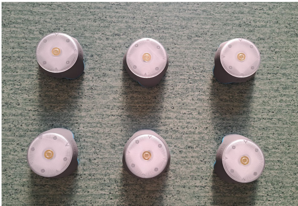
Figure 1 Blazepod Placement

signaling unit in fencing, it was decided to use the results with an accuracy of exactly one thousandth of a second. The shorter the reaction time, the higher the skill level.