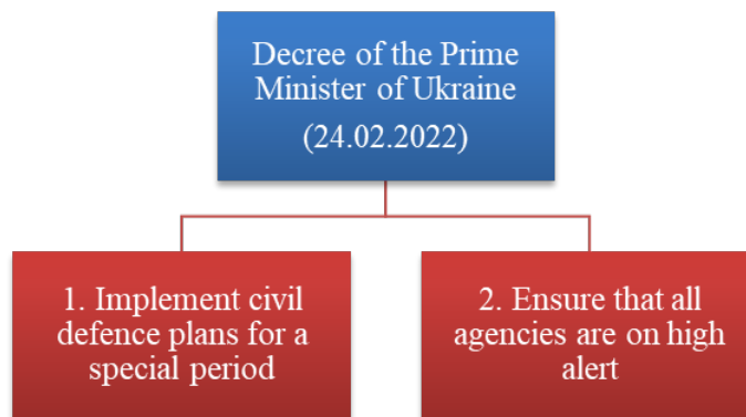
Figure 4. The decree of the Prime Minister of Ukraine on the day of Russia’s full-scale military invasion

On the day of Russia’s full-scale military assault on Ukraine, the Prime Minister of Ukraine issued a decree (figure 4).