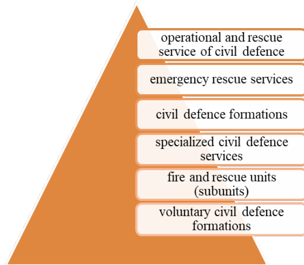
Figure 3. Civil defence forces of the unified state civil defence system