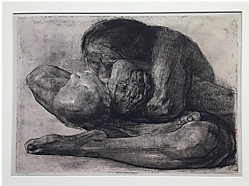
Figure 1. Woman With Dead Child , 1903, by Käthe Kollwitz

Source: The Washington Post, Great Works In Focus 121.