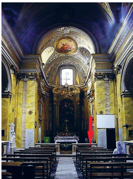
Fig. 2. Interior of the nave of the Church of Santo Stanislao dei Polacchi with the location of the epitaph marked