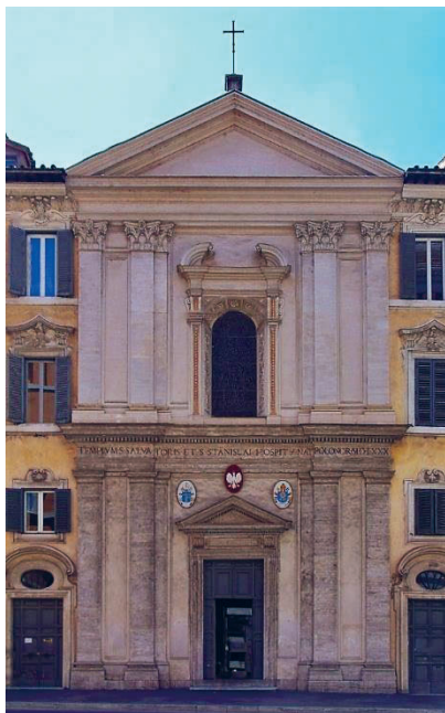
Fig. 1. Façade of the Church of Santo Stanislao dei Polacchi, Rome