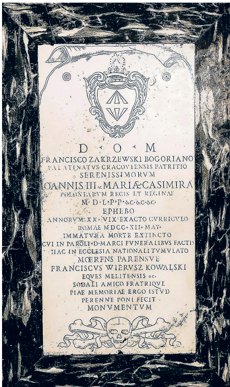
Fig. 3. Epitaph of Francisco Zakrzewski Bogoriano, pavement of the nave in front of the first right-side altar in the Church of Santo Stanislao dei Polacchi, Rome