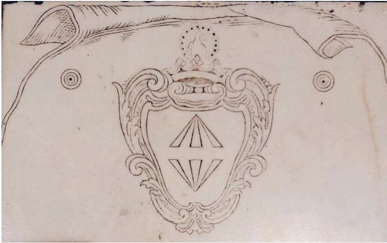
Fig. 4. The Bogoria coat of arms. A fragment of the epitaph of Francisco Zakrzewski Bogoriano, pavement of the nave in front of the first right-side altar in the Church of Santo Stanislao dei Polacchi, Rome